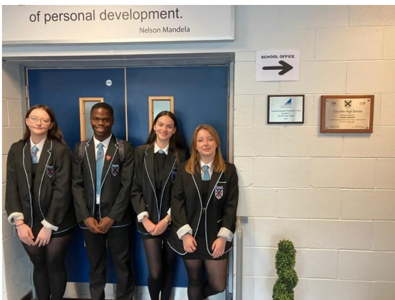
Our SCQF Ambassadors 2022/23 with our silver plaque