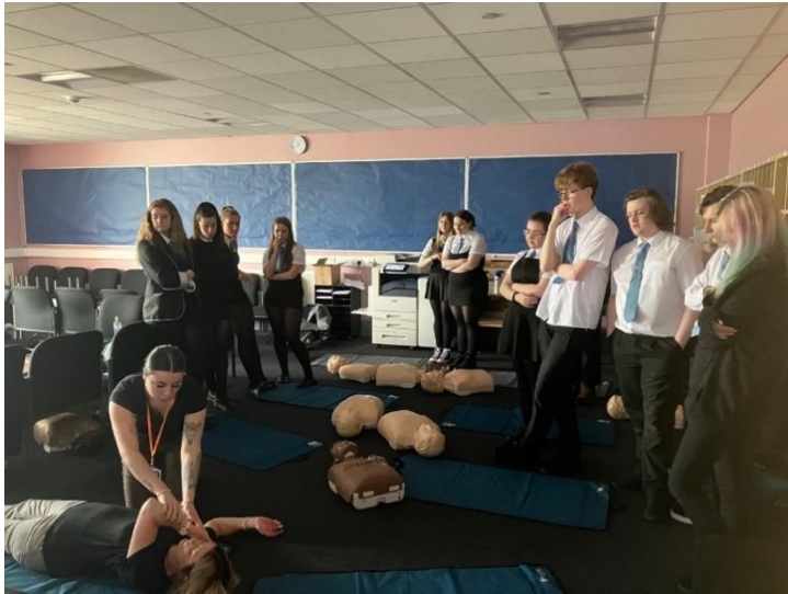
In S6, all pupils have the opportunity to gain the Level 6 Emergency First Aid at Work Award